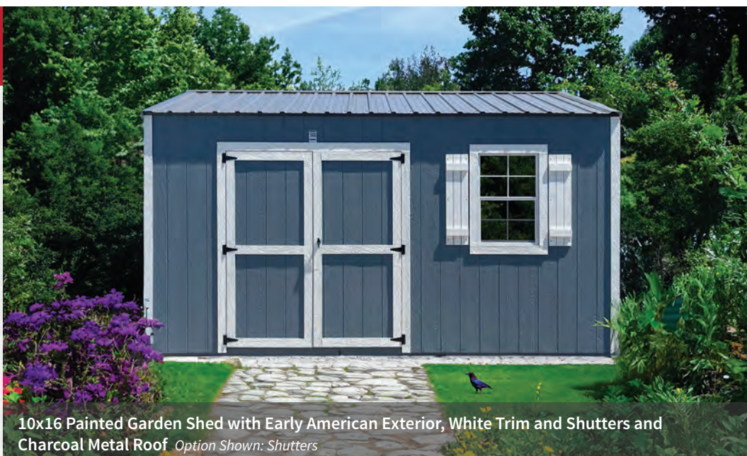
10x16 Painted Garden Shed with Early American Exterior, White Trim and Shutters and Charcoal Metal Roof Option Shown: Shutters