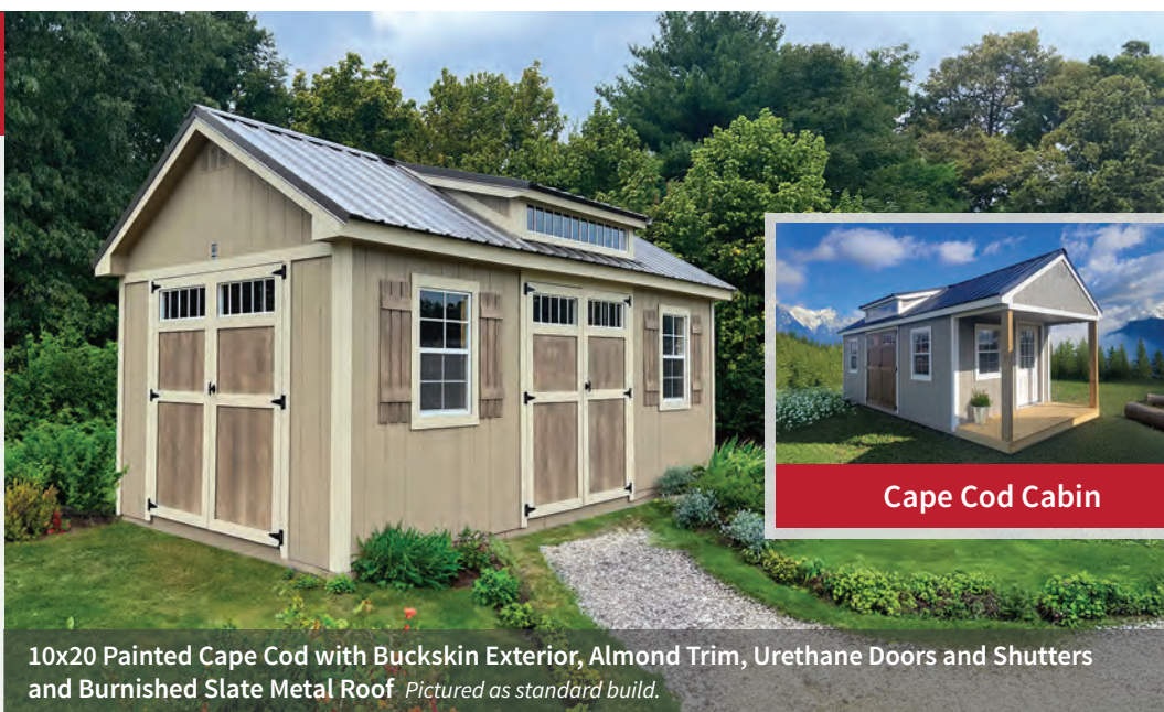
10x20 Painted Cape Cod with Buckskin Exterior, Almond Trim, Urethane Doors and Shutters and Burnished Slate Metal Roof Pictured as standard build.