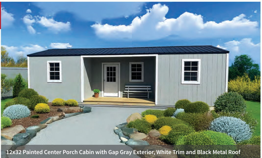
12x32 Painted Center Porch Cabin with Gap Gray Exterior, White Trim and Black Metal Roof

*Vertical metal siding option available.