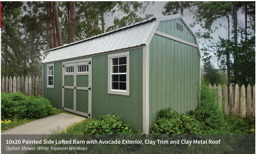
10x20 Painted Side Lofted Barn with Avocado Exterior, Clay Trim and Clay Metal Roof Option Shown: White Transom Windows