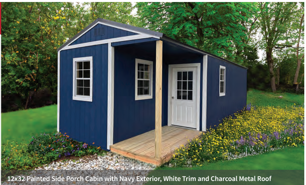
12x32 Painted Side Porch Cabin with Navy Exterior, White Trim and Charcoal Metal Roof

*Vertical metal siding option available.