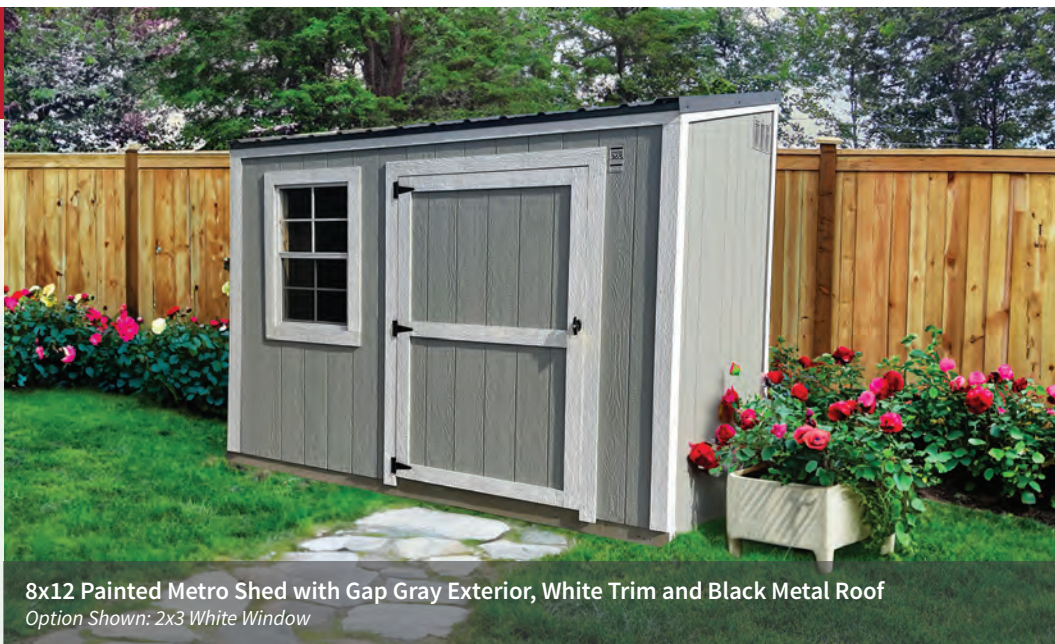
8x12 Painted Metro Shed with Gap Gray Exterior, White Trim and Black Metal Roof Option Shown: 2x3 White Window