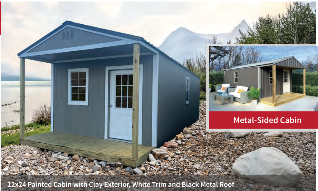
12x24 Painted Cabin with Clay Exterior, White Trim and Black Metal Roof

*Vertical metal siding option available.