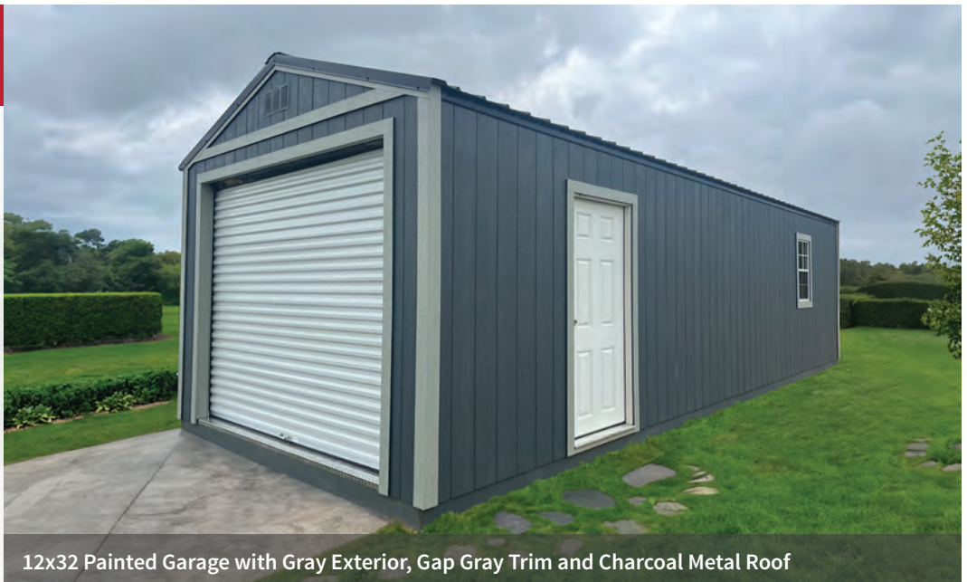
12x32 Painted Garage with Gray Exterior, Gap Gray Trim and Charcoal Metal Roof