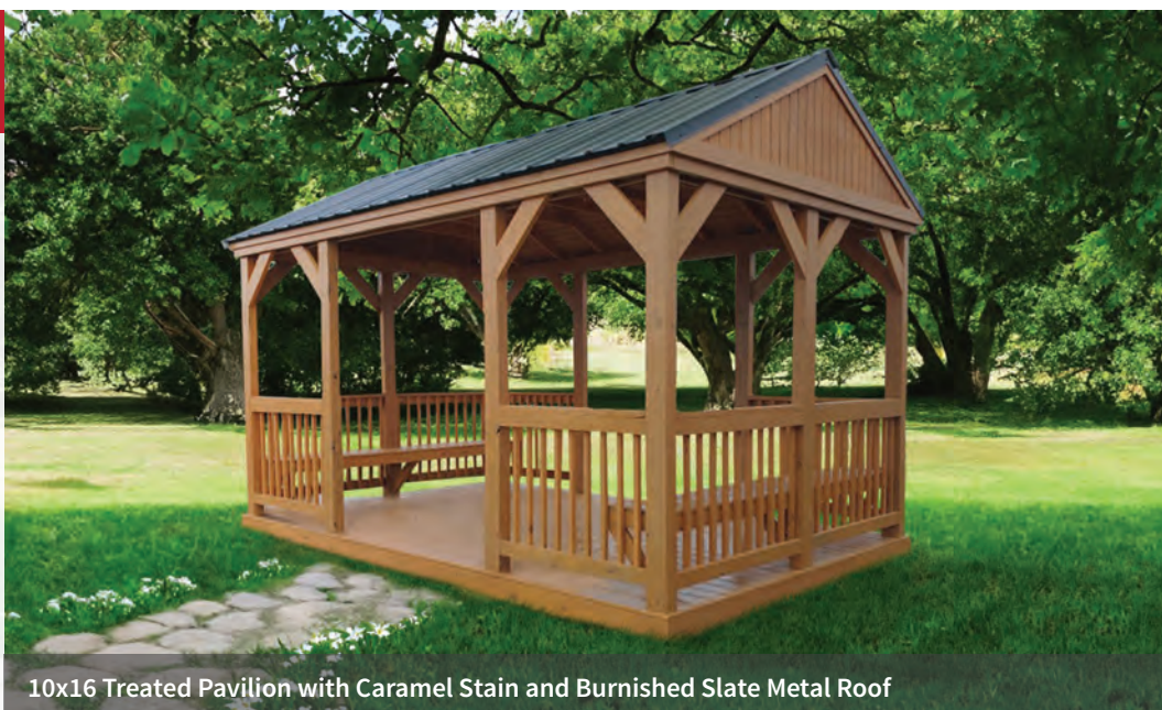
10x16 Treated Pavilion with Caramel Stain and Burnished Slate Metal Roof