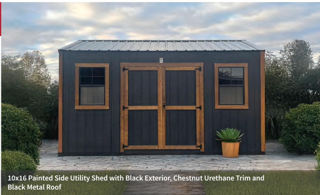
10x16 Painted Side Utility Shed with Black Exterior, Chestnut Urethane Trim and Black Metal Roof