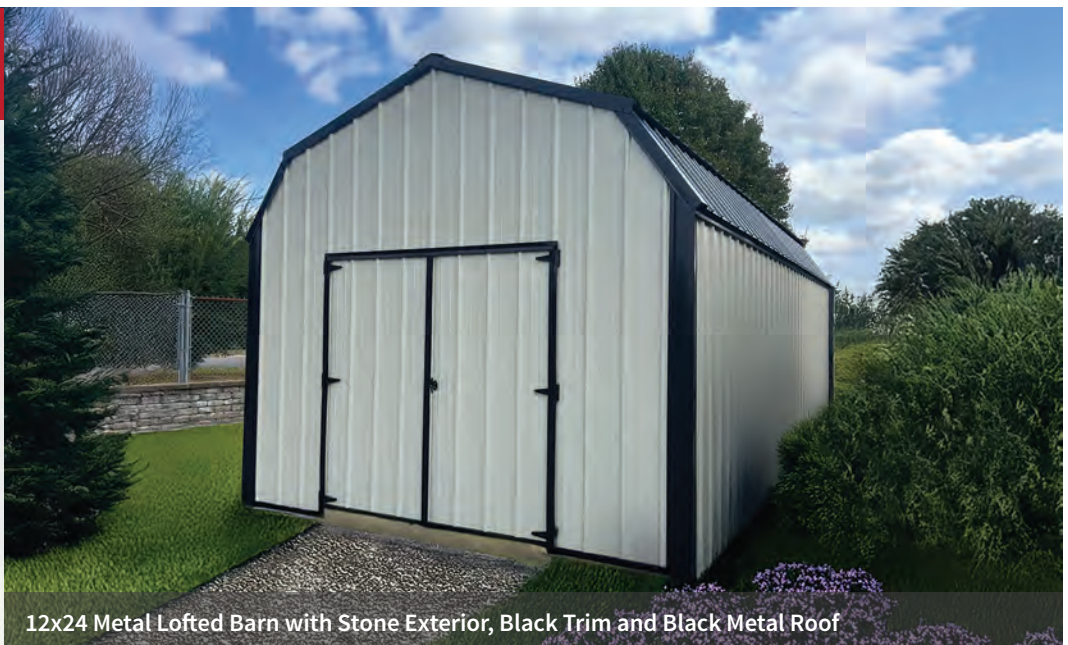
12x24 Metal Lofted Barn with Stone Exterior, Black Trim and Black Metal Roof