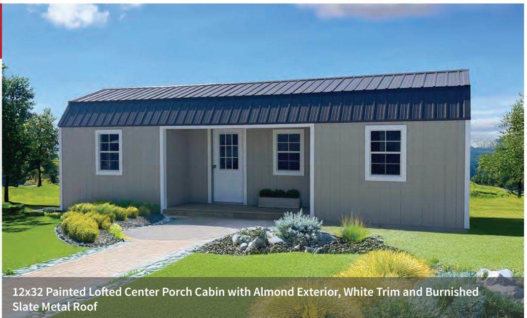
12x32 Painted Lofted Center Porch Cabin with Almond Exterior, White Trim and Burnished Slate Metal Roof

*Vertical metal siding option available.