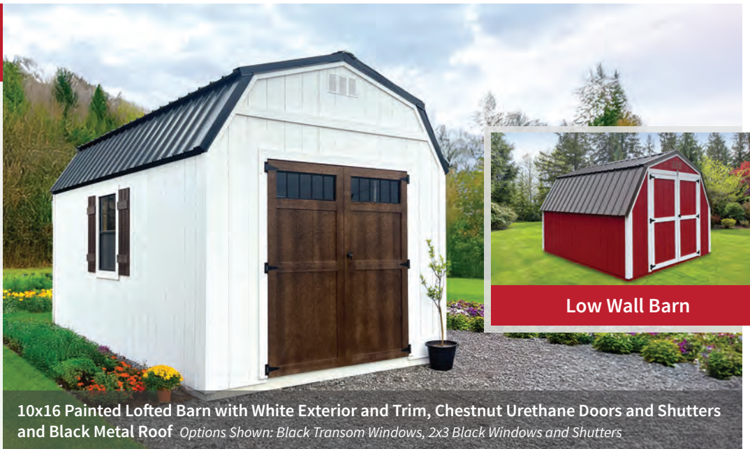
10x16 Painted Lofted Barn with White Exterior and Trim, Chestnut Urethane Doors and Shutters and Black Metal Roof Options Shown: Black Transom Windows, 2x3 Black Windows and Shutters