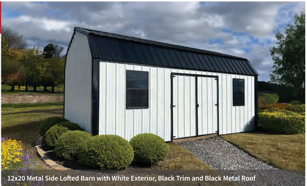
12x20 Metal Side Lofted Barn with White Exterior, Black Trim and Black Metal Roof