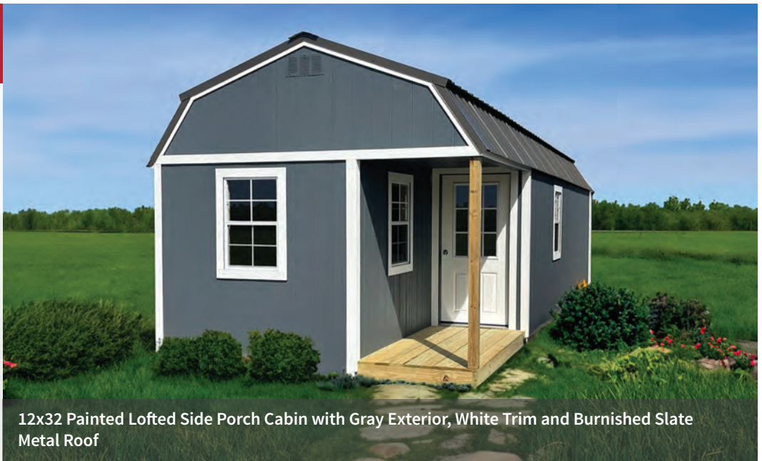
12x32 Painted Lofted Side Porch Cabin with Gray Exterior, White Trim and Burnished Slate Metal Roof

*Vertical metal siding option available.