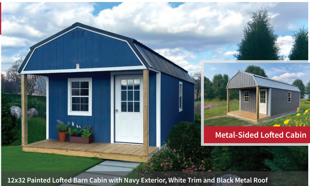
12x32 Painted Lofted Barn Cabin with Navy Exterior, White Trim and Black Metal Roof

*Vertical metal siding option available.