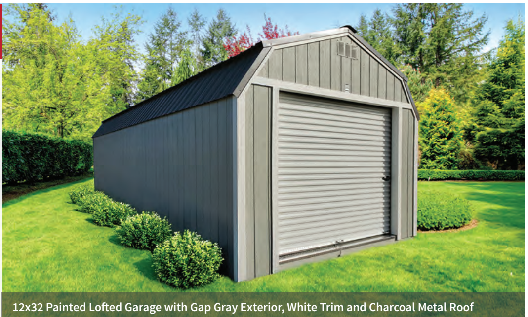
12x32 Painted Lofted Garage with Gap Gray Exterior, White Trim and Charcoal Metal Roof